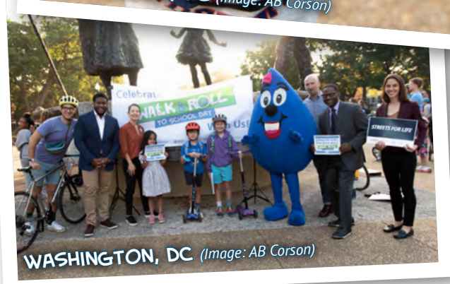
WASHINGTON, DC

“ This was a wonderful experience for our school community! We saw a 36% reduction in tardies and a 10% reduction in vehicular traffic on our Walk & Roll Day. We’re now encouraging weekly walk & roll days and movement days. - TEMECULA, CA ”