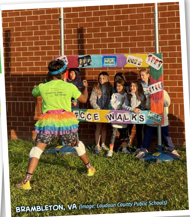
BRAMBLETON, VA