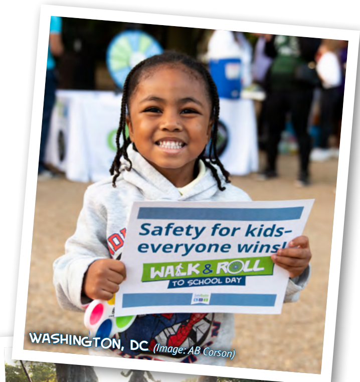
WASHINGTON, DC

Not all events go as planned; the weather doesn’t cooperate, there’s resistance from school or community decision makers, or participation is less than envisioned. Congratulations to those wonderful events that serve as energizers for more active travel and congratulations to those working to build momentum for safe, active travel. Your time and commitment matter!