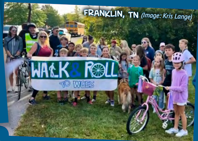
FRANKLIN, TN

For National Walk & Roll to School Day, the group engaged dozens of parent volunteers and the Williamson County Sheriff's deputies to create a safer environment for students to walk and bike to school. As the Walnut Grove Community Alliance for Road Safety noted on their Facebook page, "this is the wake-up call to improve our community's multimodal transportation and improve safety." The county is now applying for a state Transportation Alternatives Program grant to build sidewalks in the right-of-way on the busiest road.