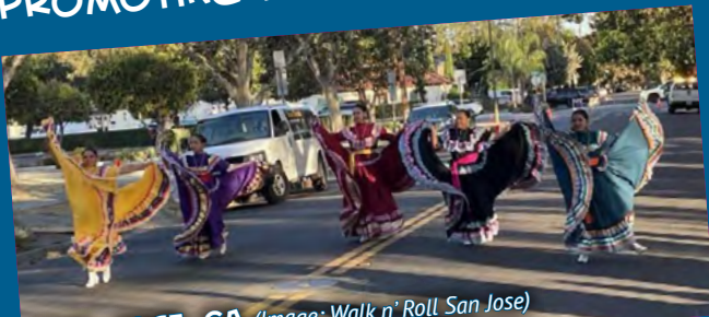
SAN JOSE, CA

In California, the Viva Escuela SJ open streets event conducted in conjunction with Walk & Roll to School Day embraced all three of the top motivations. The San Jose Walk n' Roll program, part of the San Jose Department of Transportation, worked with partners and the school for permission to close the street in front of a school for a morning to focus on walking and biking to school. That process required the city Department of Transportation, Office of Cultural Affairs and Police Department to work together.