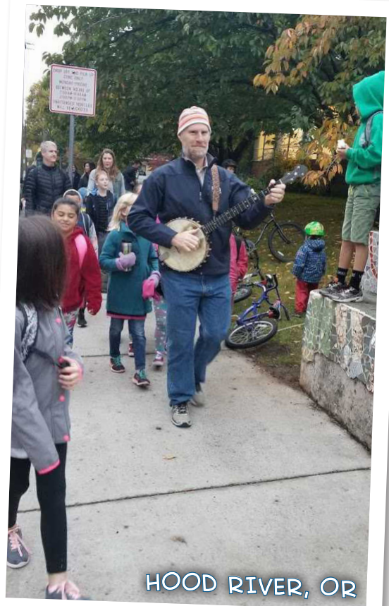
HOOD RIVER, OR