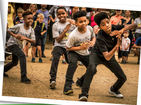
TYLER ELEMENTARY SCHOOL'S ALL STAR STEPPERS ENERGIZE THE CROWD AT LINCOLN PARK IN WASHINGTON, DC.

The National Center for Safe Routes to School, which organizes Walk to School Day, celebrated the national event in the nation's capital. Representatives including those from the U.S. Department of Transportation, FIA Foundation, District Department of Transportation, Washington, DC Mayor's Office, Capitol Hill Public Schools Parent Organization and the Pedestrian and Bicycle Information Center joined hundreds of students, teachers, school leaders, parents and local and national transportation safety professionals at Lincoln Park for an electrifying celebration before kids walked to 17 area schools.