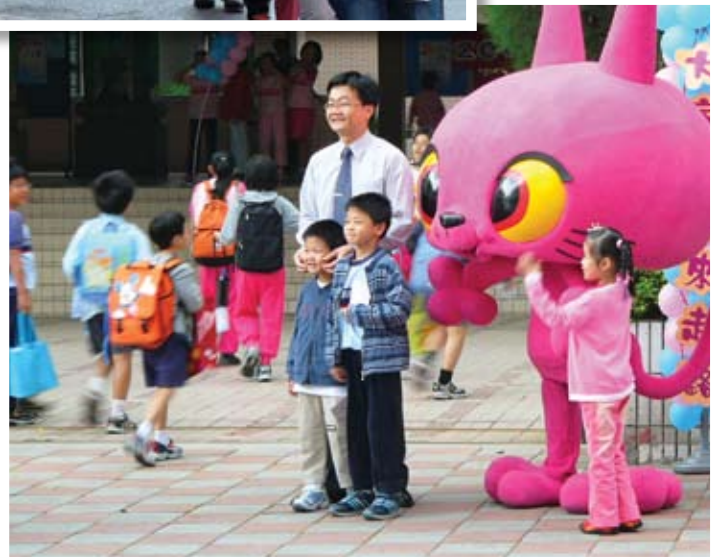
Taipei City, Taiwan

Communities from the following 38 countries participated in International Walk to School events.