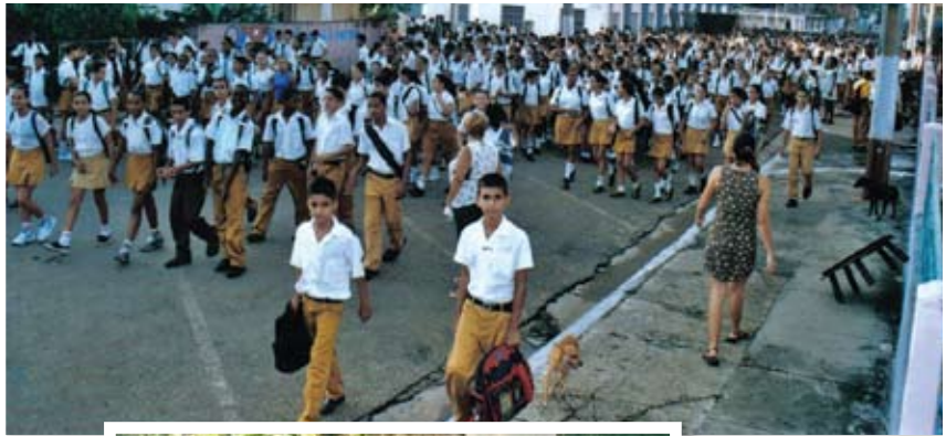
Jovellanos, Matanzas, Cuba

The USA is one of many countries that care about promoting safe walking to school and is a member of the International Walk to School Committee. The PBIC hosts the international Web site that contains information from around the world at www.iwalktoschool.org .