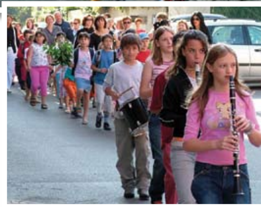
Mezago, Milan, Italy