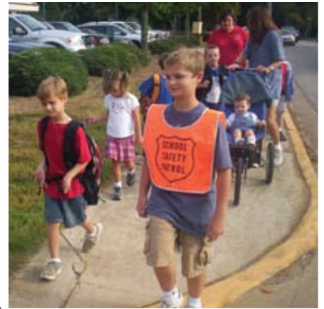
Wake Forest, NC