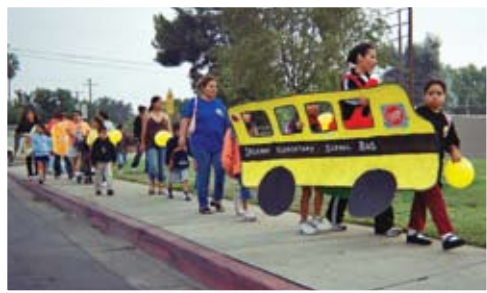
San Bernardino, CA